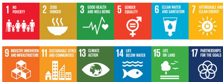
Fig. 1 - WMO contribution to the SDGs