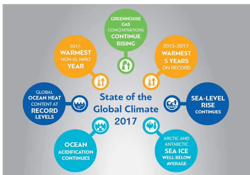
Figure 2- Headline indicators of the climate system as used in the WMO Statement (2017)

The WMO Statement on the State of the Global Climate in 2017, submitted to UNFCCC COP 23 in Bonn, Germany, incorporated additional indicators to describe in a more contextual way how Earth's climate is changing. (Figure 2).